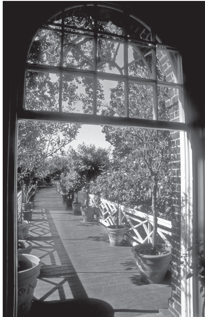
The South Terrace, from the Greenhouse.