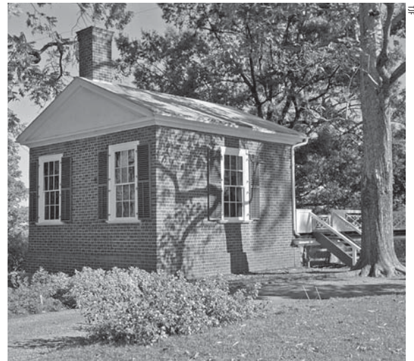
Monticello's North Pavilion.