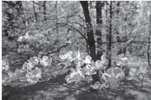
Dogwood flowers on the grounds of Monticello.